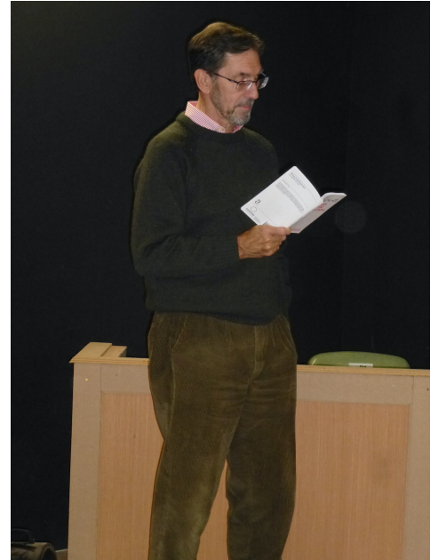
Witness for the Prosecution - rehearsals under way