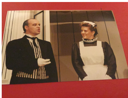
Photos are of a performance by the British Embassy Players in Bonn (approx 1988)

We very much hope for the evening will be well-supported. It should be a lot of fun - do come along!