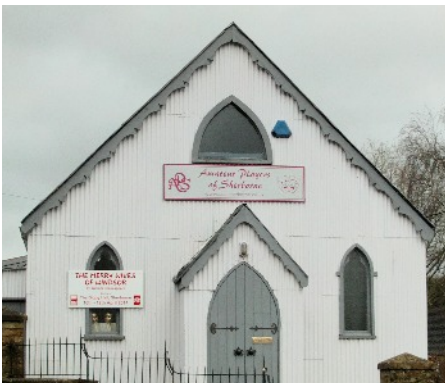
Getting it in early - mid-December the sign on our clubhouse proclaims the coming of 'The Merry Wives of Windsor' in April.