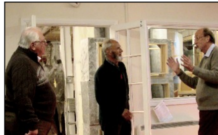
'The Winter's Tale' rehearsals now in full swing.