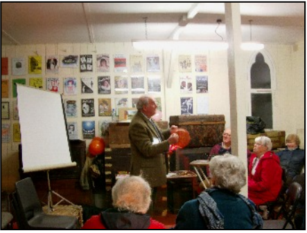
Revealed: why the balloon wouldn't pop

And then, following some absolutely hilarious video clips from his productions, the evening was topped off with almost everyone playing a part in a spirited read-through of Act 2,