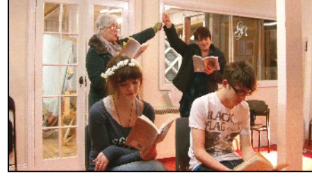
Wyrd Sisters and the Fool in rehearsal

Something is rotten and really quite stinks in the Kingdom of Lancre (pronounced Lanker). The King is dead, Long Live the King! Well actually no, because the New King, the evil Duke Felmet, murdered the previous King and