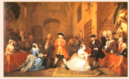
Illustration of Beggar's Opera performance

A theatre of note between 1642 and 1800 was The Haymarket Theatre, operated by Samuel Foote. (Foote was given special license to operate in the summertime because of sympathy after he had a freak riding accident while trying to prove that he wasn't effeminate.)