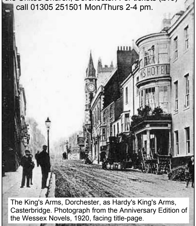
The King's Arms, Dorchester, as Hardy's King's Arms, Casterbridge.

As part of the 19th International Thomas Hardy Festival and Conference programme of events the New Hardy Players will be performing The Mayor of Casterbridge at 8 pm on Sunday 25th July in the United Church, Dorchester. For tickets (£10) call 01305 251501 Mon/Thurs 2-4 pm.