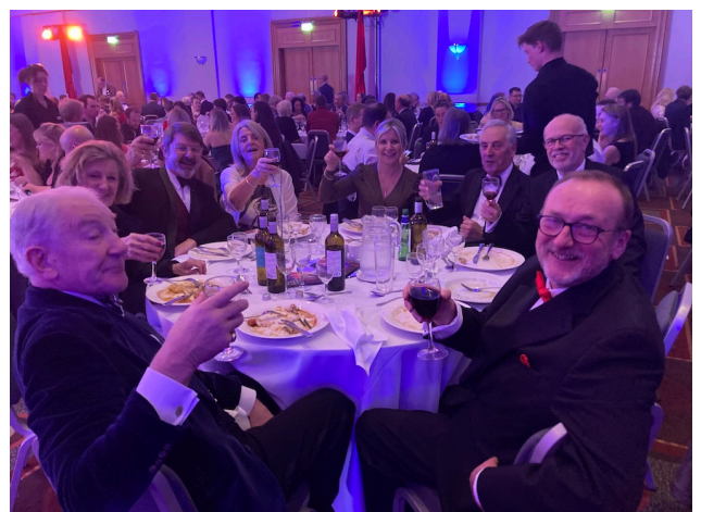
The (rather rowdy) APS table