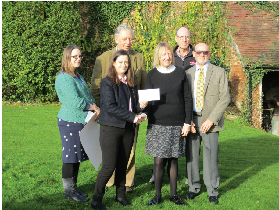
We benefit from Sherborne Summer Festival to the tune of £250