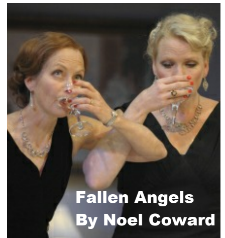
Fallen Angels By Noel Coward