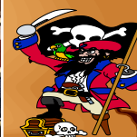
Andrew Cross and Kris Wessels in Best Pirate Outfits ➤